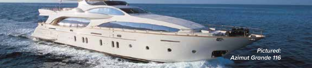
Pictured: Azimut Grande 116