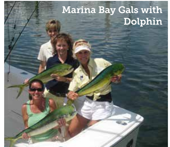
Marina Bay Gals with Dolphin

Visit: www.ladiesletsgofishing.com , Call: 954-475-9068 Email: fish@ladiesletsgofishing.com ❖