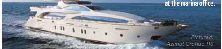
Pictured: Azimut Grande 116

Florida Yacht Management is located upstairs at the marina office.