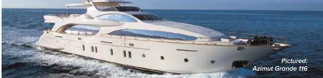
Pictured: Azimut Grande 116